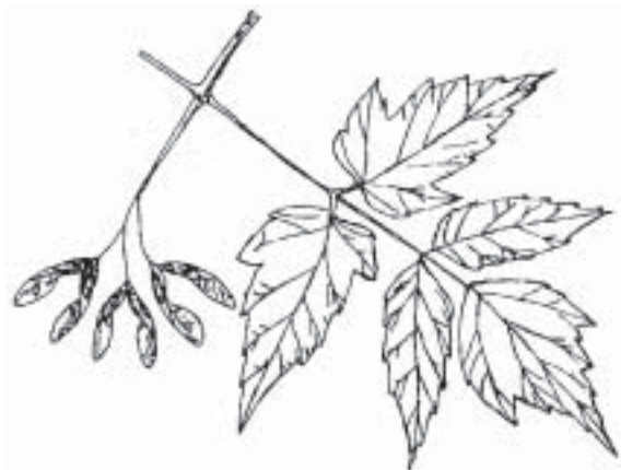
Female Boxelder Tree