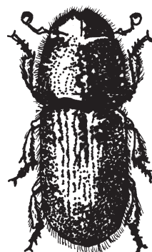
Southern Pine Beetle (Dendroctonus frontalis)

black and from 2 to 4.5mm long. The full-grown larva is a whitish, legless grub with a glossy reddish-brown head, and about 5mm long. Egg, larva, pupa and adult stages, overwinter under the bark. The beetles generally attack the middle and upper parts of the tree trunk first, then work their way down the trunk to within 1.5 meters of the ground. Symptoms of the attack include white to reddish pitch tubes and reddish boring dust on rough bark.